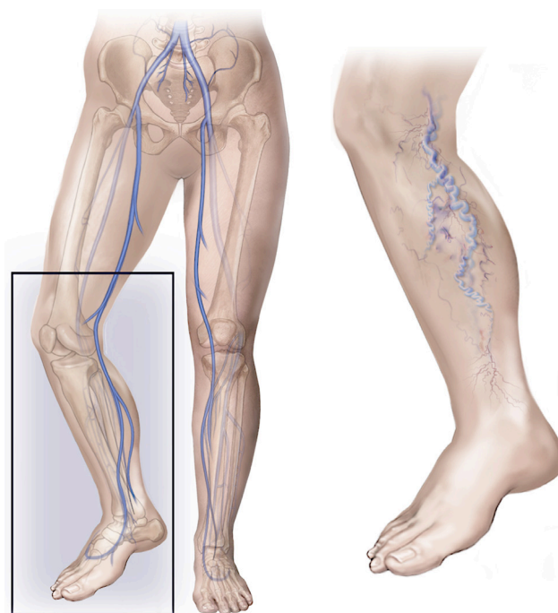
Figure 1 Varicose veins

If you are having treatment purely for cosmetic reasons, you need to ask your surgeon if foam sclerotherapy will help. This will give you realistic expectations about the final result.